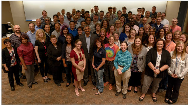
Illinois Computer Science faculty and staff.

Applicants are required to have (or expected to receive) a PhD or equivalent degree in Computer Science or a related field. Additional qualifications include the ability to teach effectively at both the graduate and undergraduate levels and the potential to initiate and carry out independent research. Ideal candidates include those who demonstrate evidence of a commitment to diversity.